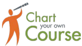
Chart Your Own Course Sanofi Genzyme Scholarship Program

TYPE OR PRINT ALL INFORMATION EXCEPT SIGNATURES